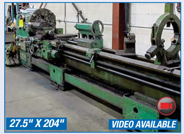
PBR TM-350 GAP BED LATHE