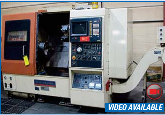
OKUMA ACT-4 CNC LATHE