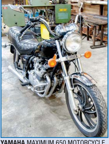
YAMAHA MAXIMUM 650 MOTORCYCLE