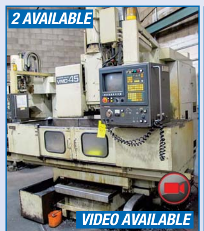
SHIBAURA VMC-45 CNC VERTICAL MACHINING CENTER

Visit infinityassets.com for complete specs and additional photos