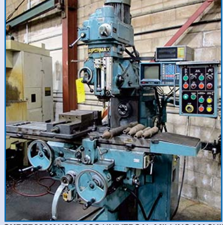
SUPERMAX YCM-2GS UNIVERSAL MILLING MACHINE